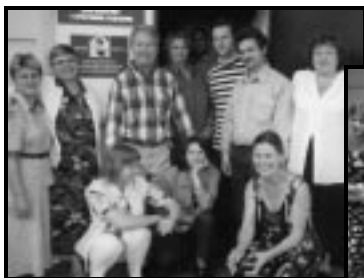
(Above) MILSAC staff and volunteers, Summer 2000