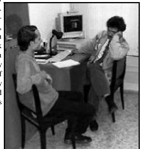
The complex social, emotional and legal problems facing Russian orphans keep MILSAC counselors hard at work.

ages-- to give these kids a chance to fulfill their potential. Now, we've added a crucial program to make sure they don't fall into the cracks after they leave their orphanage. Helping these kids re-integrate into society, continue their education and/or find decent work is the best way we can help make sure they don't turn to a life of crime or become easy prey for traffickers and others who pick up kids like these."