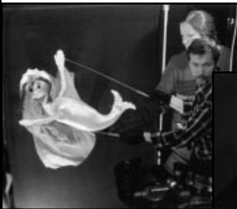
MiraMed directs the Ratatouille Puppet Theatre of Nizhni Novgorod in creating the Angel Coalition's first anti-trafficking TV commercial featuring a "trafficker" trying to "catch" a young girl.