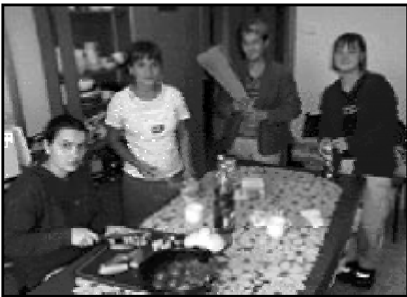
Part of attaining independent living skills involves learning how to budget, shop and prepare nutritious meals for a household. MILSAC students enjoy the results of their efforts.

MiraMed has also reached out to the private sector for support. There are hundreds of American companies doing business in Russia and many are members of the