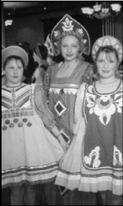
Your donations helped these Uglich Orphanage girls learn to design and sew beautiful traditional costumes.

Only a handful of organizations are working to help these children and one of them is MiraMed Institute. Our only source of support for aid to these children is through grants and donations. Your gift keeps hope alive. Thank you for continuing making a difference ....one child at a time!