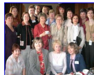
Angel Coalition members developed a strategic plan for lobbying in support of pending anti-trafficking legislation in Russia.

MiraMed Institute in partnership with the Angel Coalition opens Russia's first Trafficking Victim Assistance Center