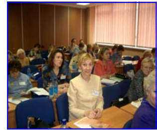
The directors of Russia's first network of safe houses for trafficking victims participated in an international protocol writing sessions after visiting European safe houses this year.

In September 2003, MiraMed Institute and the Angel Coalition received a grant from the Swedish International Development Agency to provide technical assistance for a public education anti-trafficking program in Murmansk, which is on the border of Norway and is a major trafficking route into Scandinavia.