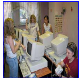
Students and teachers from Garfield High School in Seattle work with students in St. Petersburg orphanages to set up two fully functional computer laboratories.

One of the orphanages we chose to receive computers sends their high-risk teenaged girls to our Center of Social Adaptation in St. Petersburg—a good example of how MiraMed builds upon its relationships to bring about positive changes in the lives of Russia's orphans.